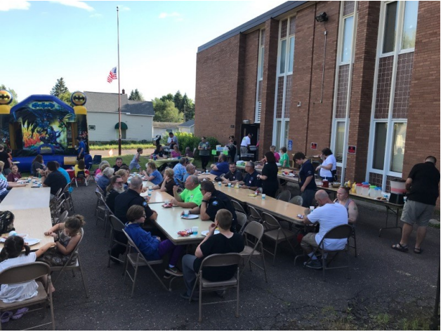
Elim would like to thank the West Duluth Police & Fire Departments for also showing up.

Elim’s NNO Picnic brought the neighborhood out for a night of great food and fun. It is an opportunity for people of the community to experience the hospitality of the people of Elim and get to know each other. Approximately 100 people from around the area came to the free picnic sponsored by Elim Lutheran Church.